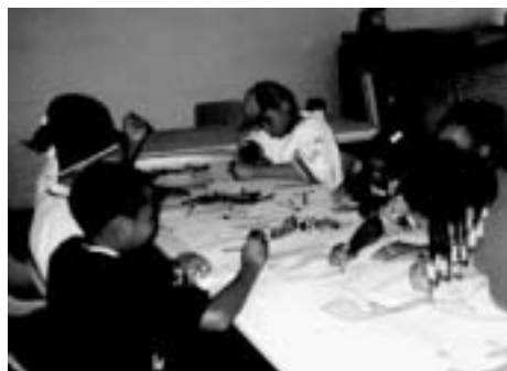
Kids helping decorate the Spring Break poster.

The week's activities included baking bread, making puppets, straw painting, a nature scavenger hunt and jungle animal games. Kids also