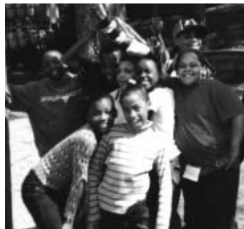
Camelot youth take a 'break' to enjoy the weather.

Thank you AmeriCorps members for your leadership on this project and for making a difference for kids!