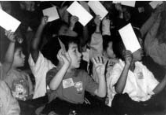
AIK's at Jefferson Elementary.