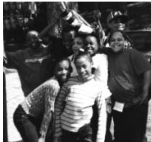
Camelot youth take a 'break' to enjoy the weather.

Thank you AmeriCorps members for your leadership on this project and for making a difference for kids!